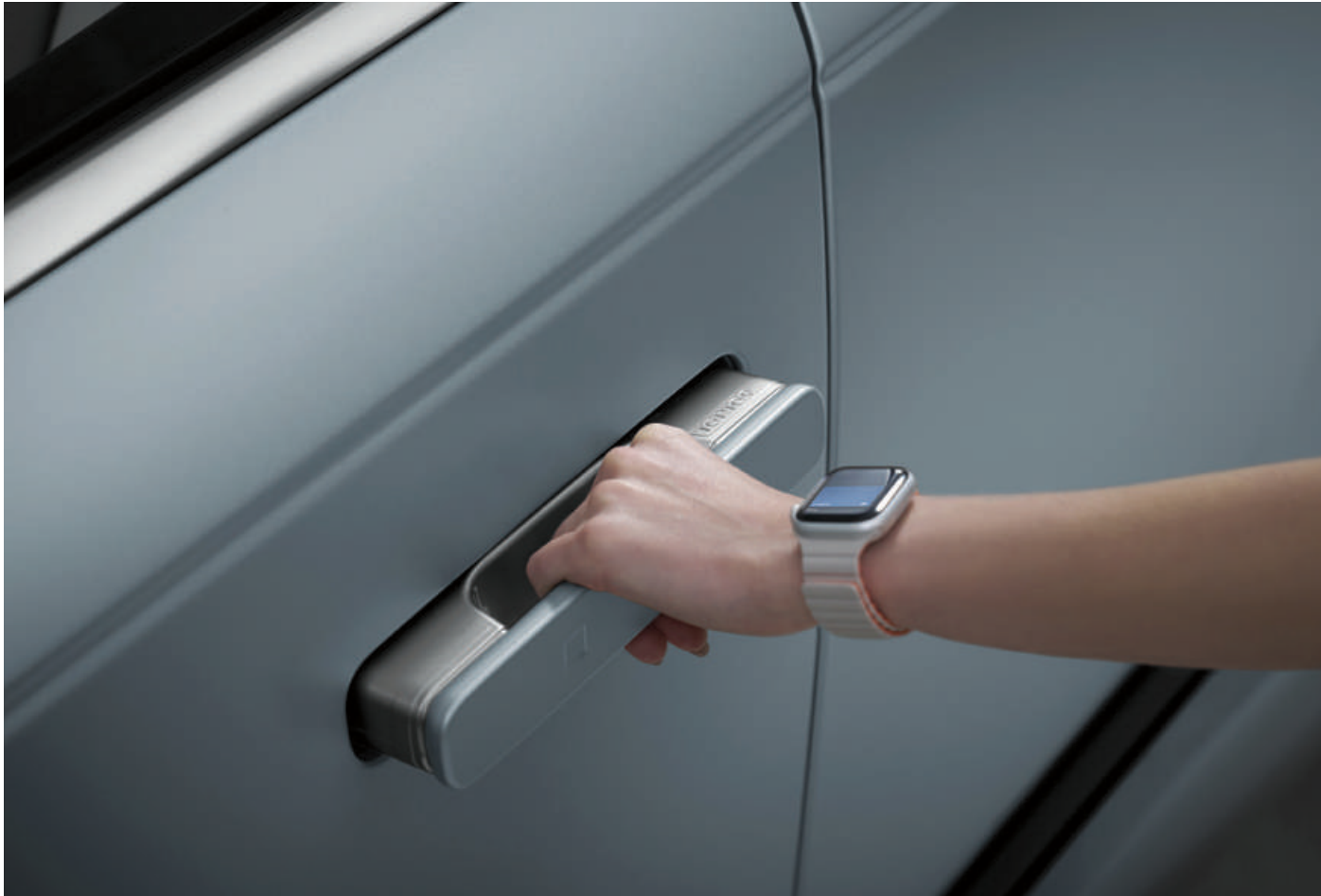
Digital Key 2.0