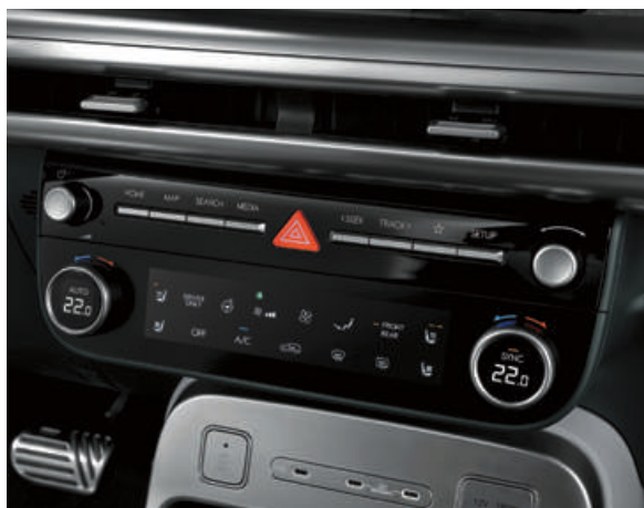
Interactive Pixel Lights Dual Automatic Temperature Control