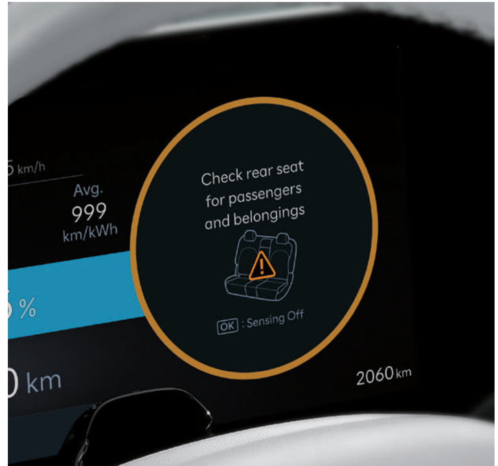
Rear Occupant Alert (ROA)