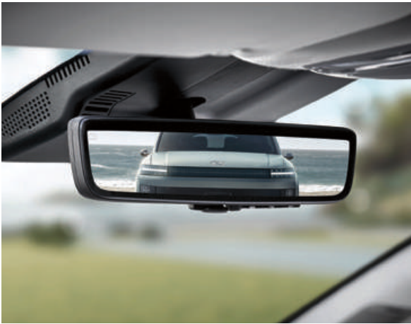
Digital Center Mirror (Full-Display Rearview Mirror)