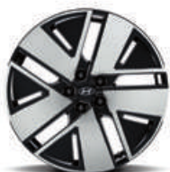
20" Alloy Wheels (Standard)