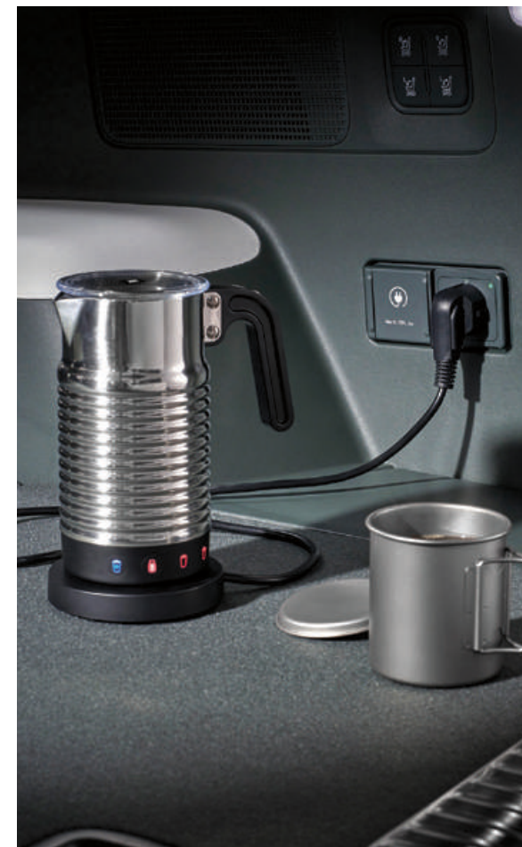
Indoor Vehicle-to-Load (V2L)