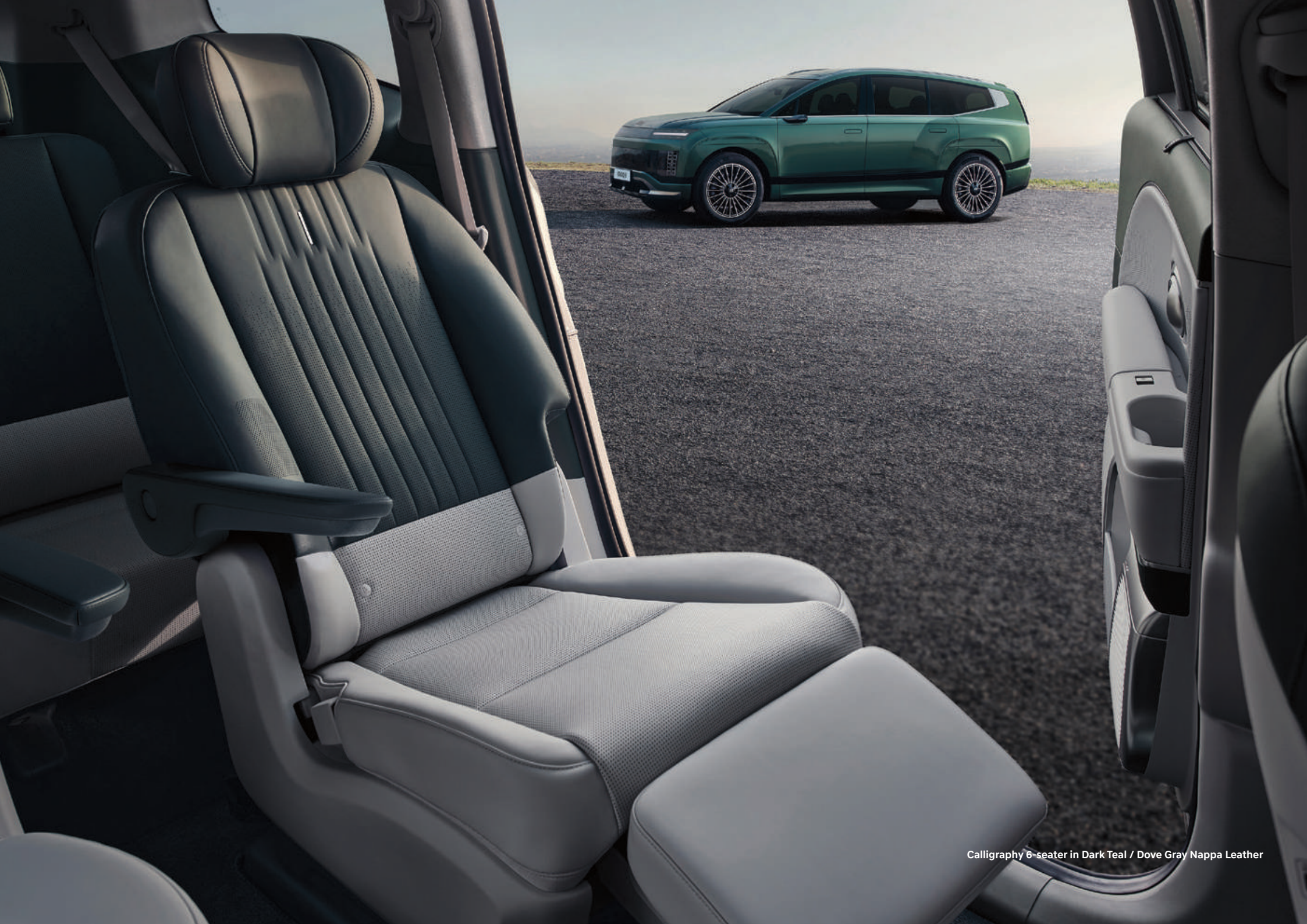
Calligraphy 6-seater in Dark Teal / Dove Gray Nappa Leather