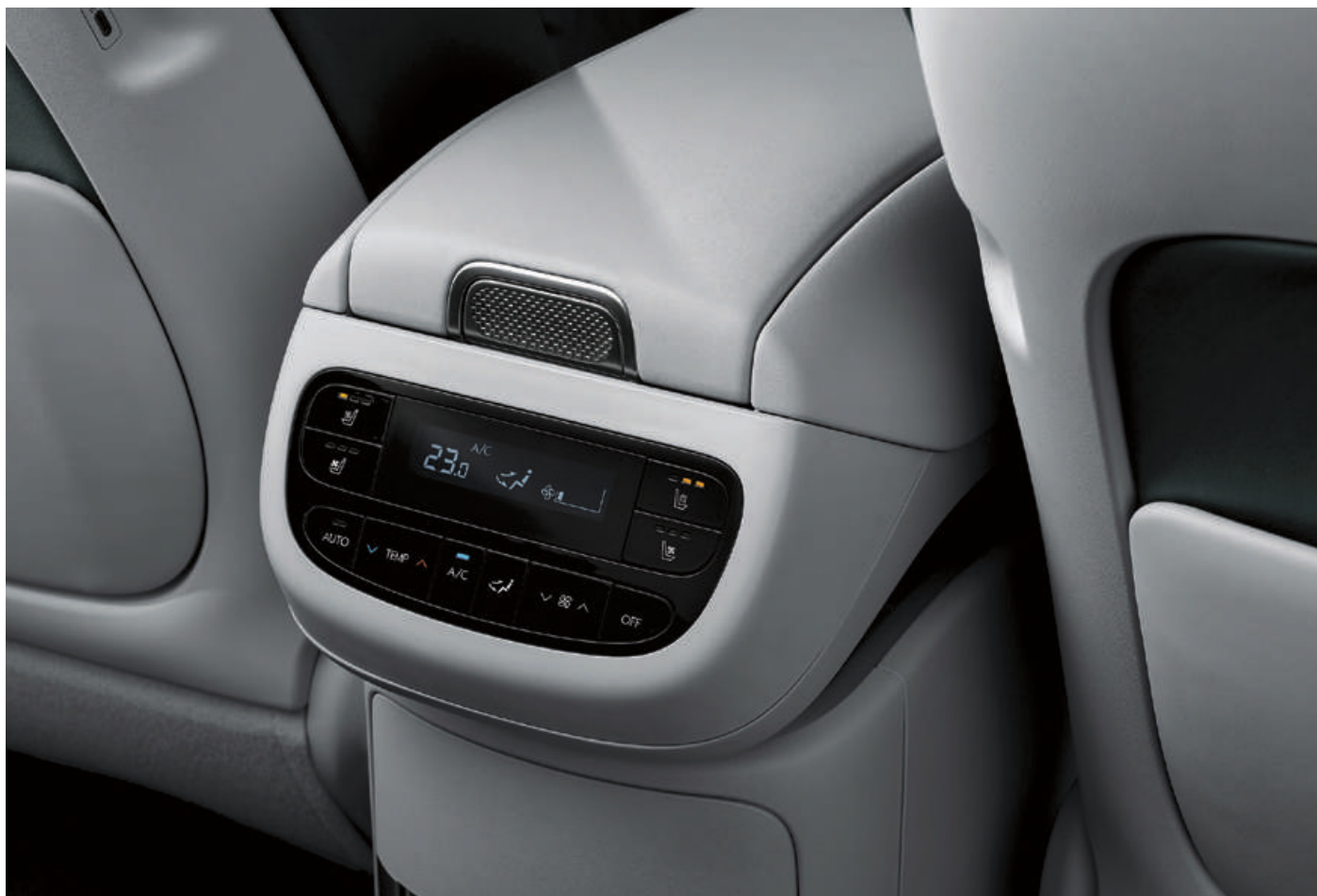
Independent Automatic Temperature Control (2nd-row)