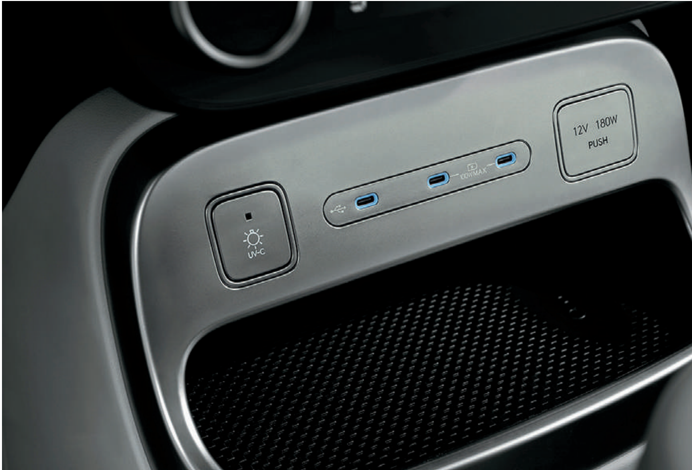
100W High-Output USB-C Ports (1st-row))