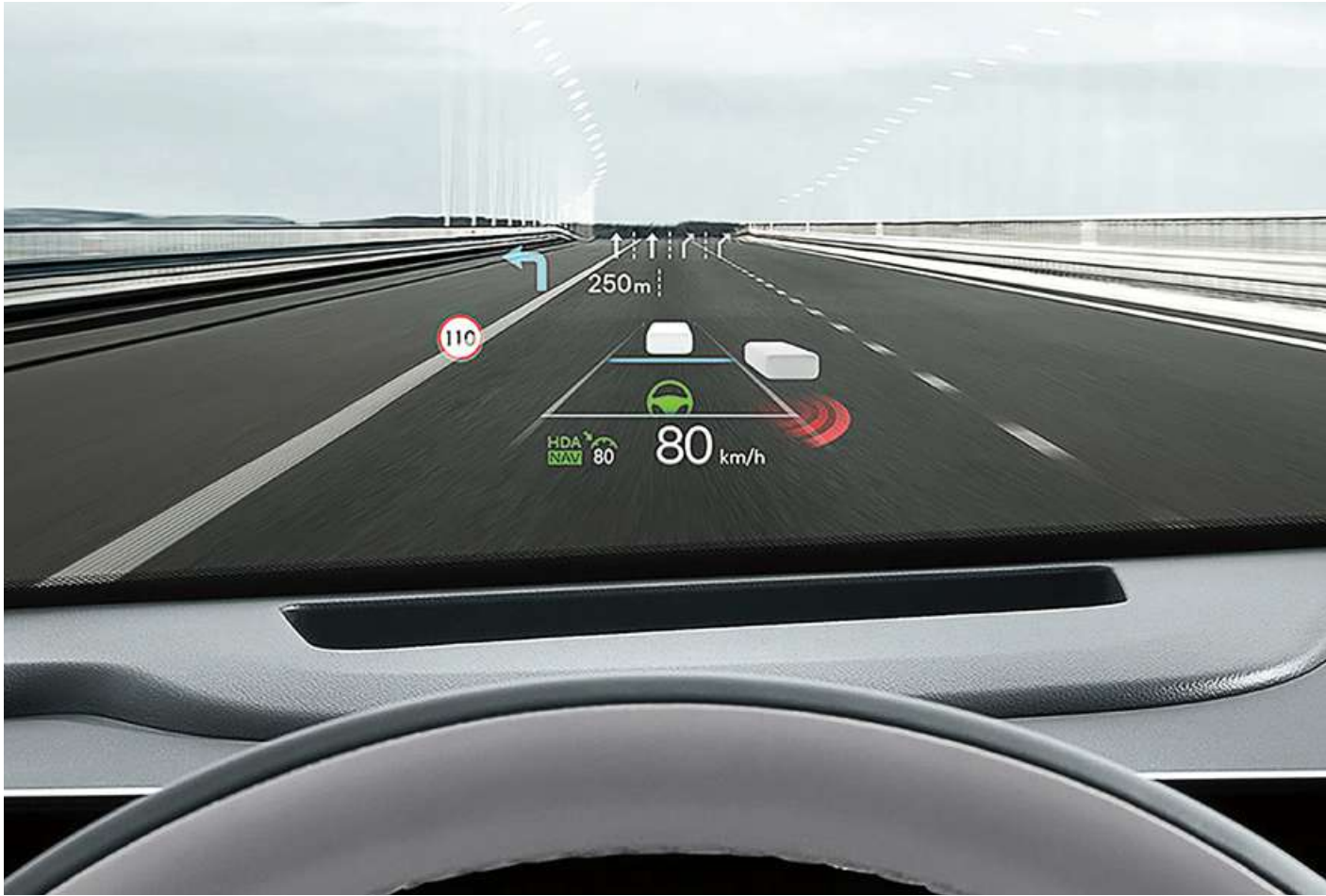
Head-up Display (HUD)