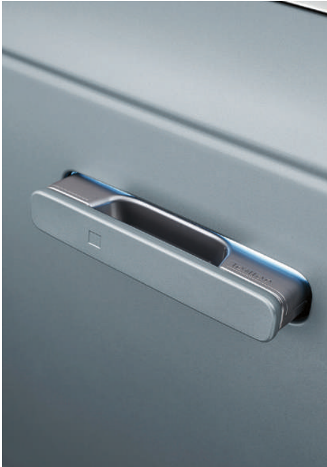
Auto Flush Door Handles