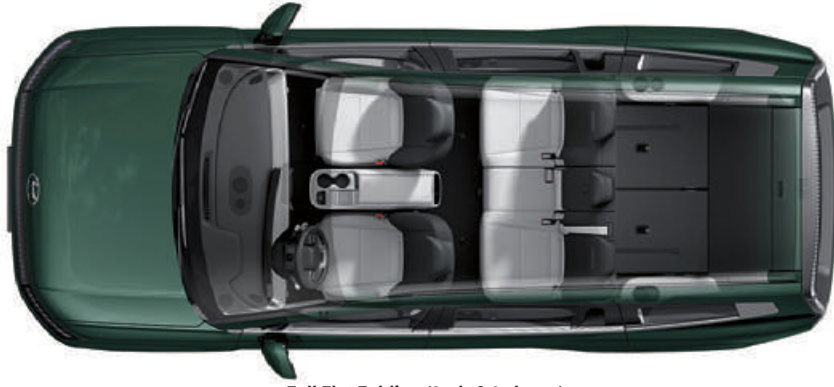
Full Flat Folding (2nd- & 3rd-row)