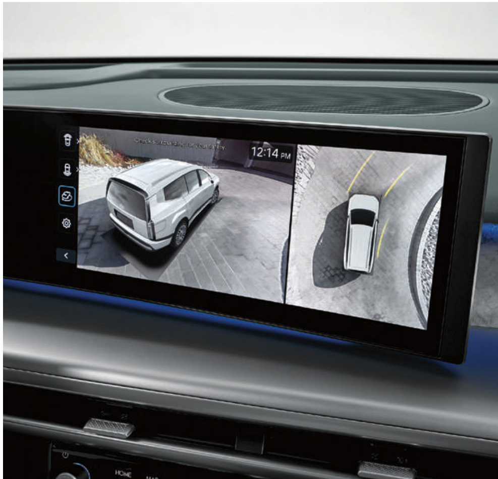
Surround View Monitor (SVM)