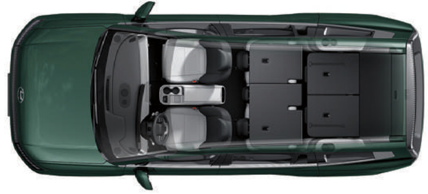
Flat Folding (3rd-row)