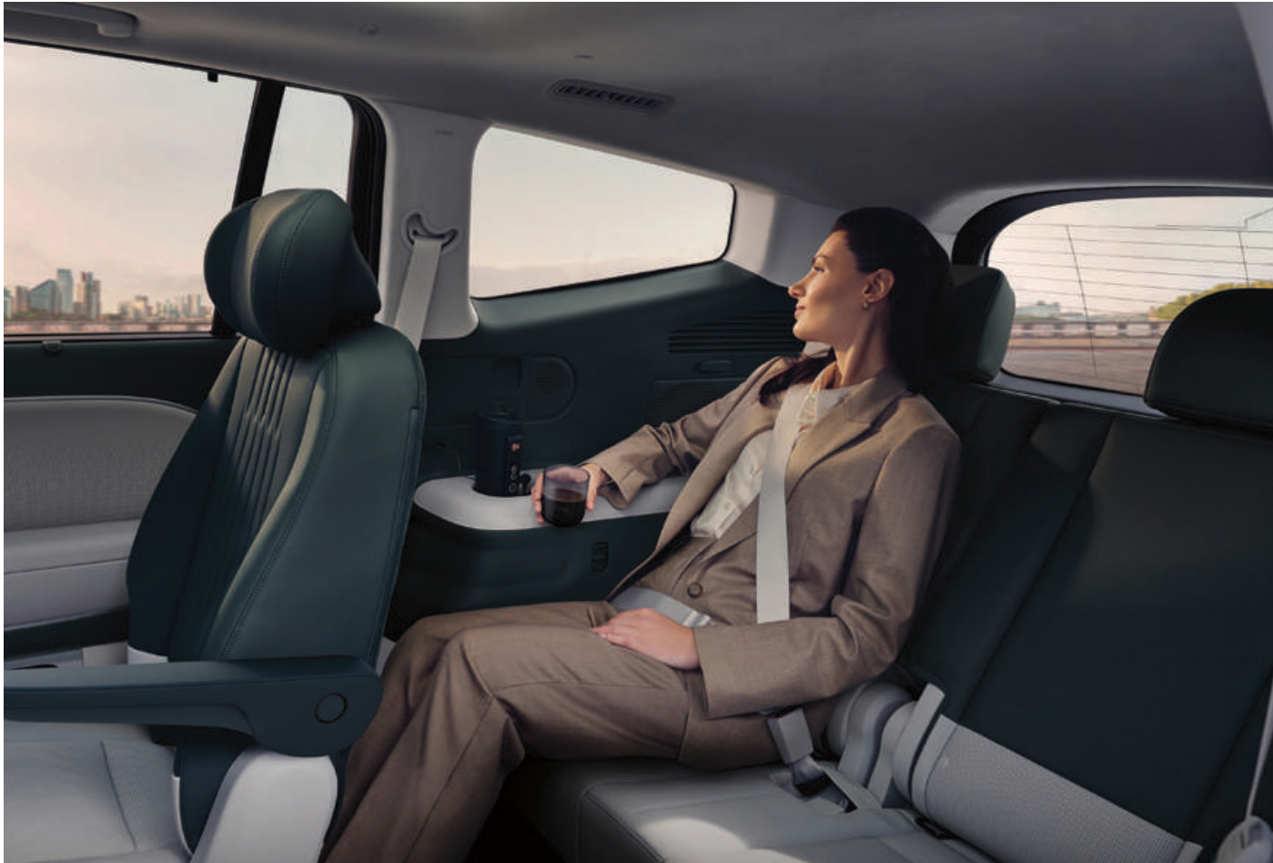
Powered 3rd-row Seats (Folding / Reclining / 7-Seater)