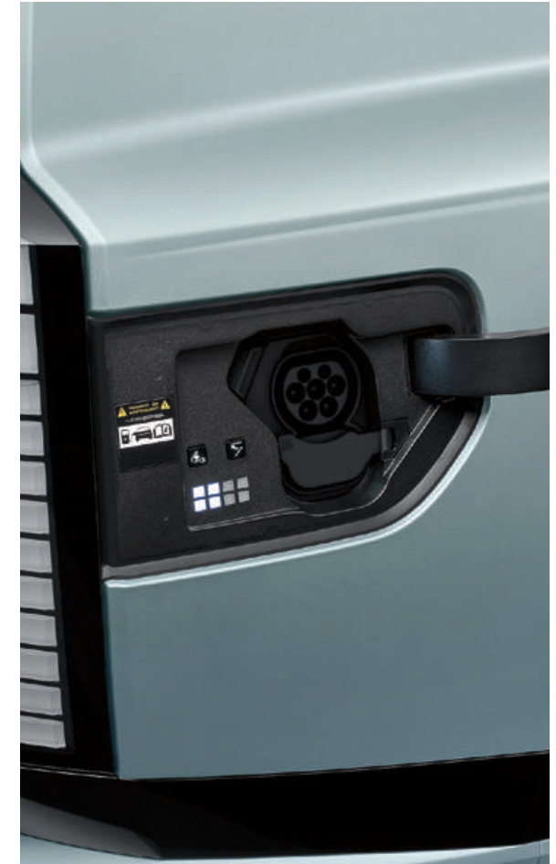
Electric Charging Door