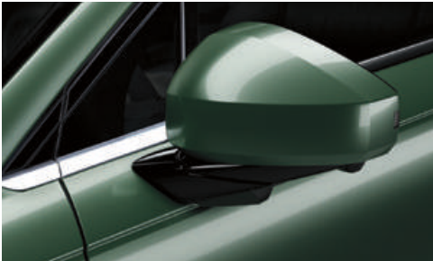
Power Folding Side Mirrors (LED Turn Indicators)