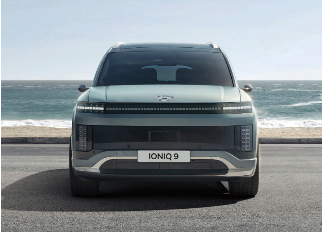
Parametric Pixel Light Design

The uniquely bold exterior blends seamlessly with the signature Parametric Pixel Lights, adding depth to the futuristic style.