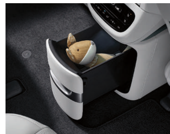
Console Box (Top) Sliding Tray (Bottom)