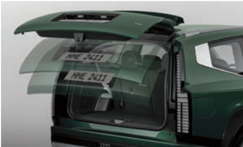
Smart Power Tailgate (Height Adjustable)