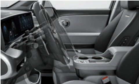
Power-adjustable Tilt & Telescopic Steering Wheel