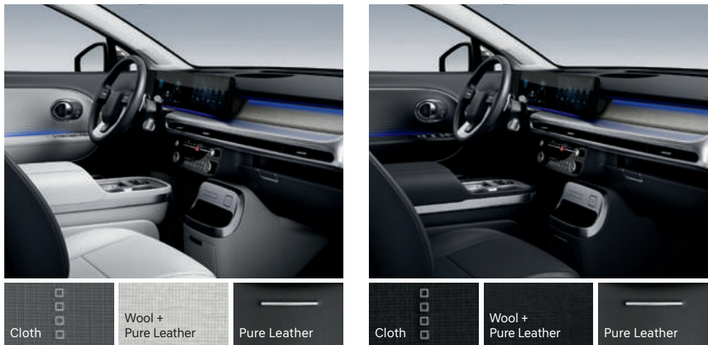
Obsidian Black / Dove Gray (YGU)