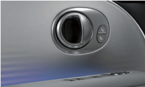
Integrated Memory Seat