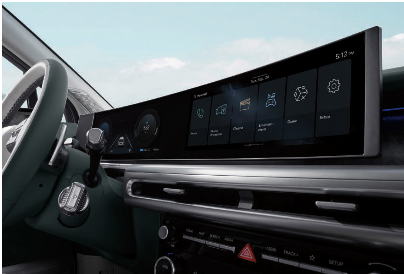
Panoramic Curved Display (12.3-inch Cluster & Touchscreen ccNC)