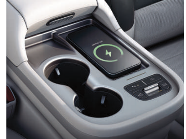
Wireless Charger Open Tray