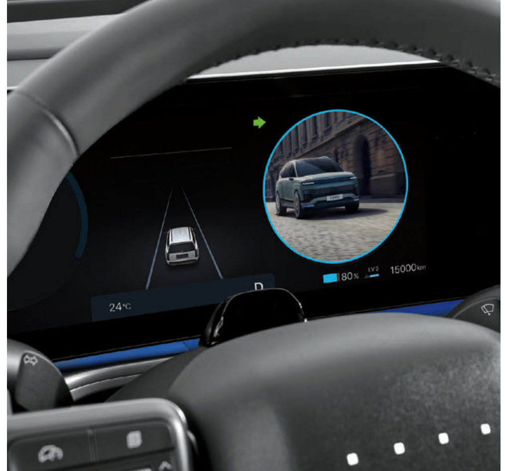
Blind-Spot View Monitor (BVM)