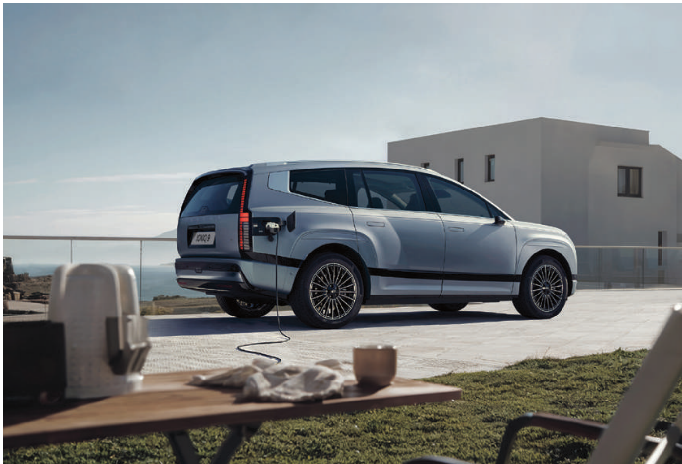
Outdoor Vehicle-to-Load (V2L)