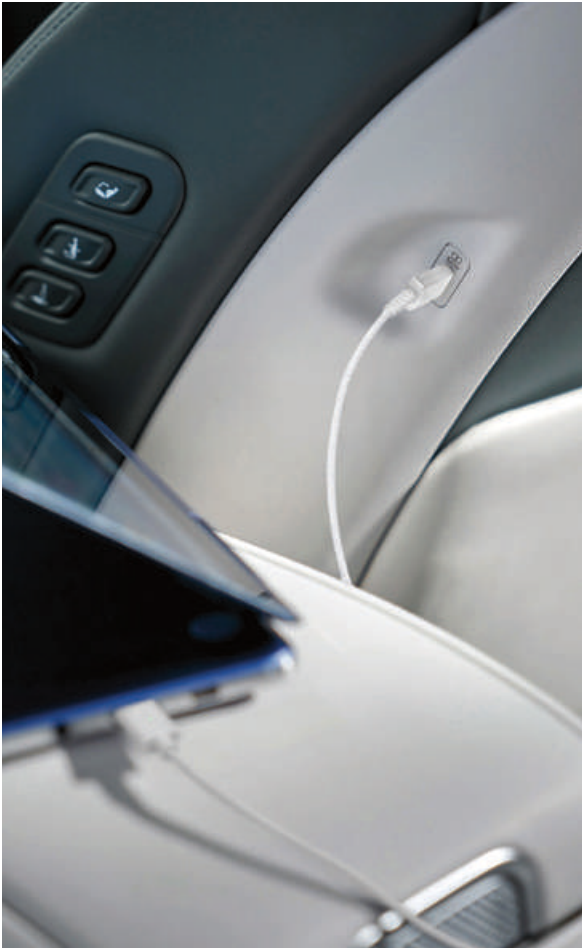
100W High-Output USB-C Ports (2nd-row)