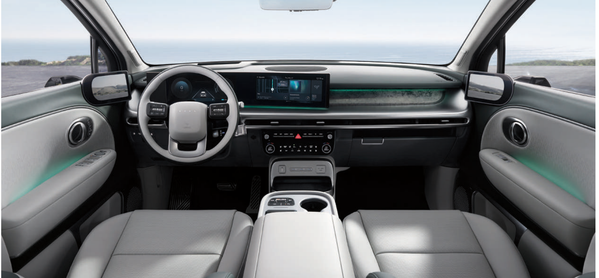
Driver-centric Architecture / Ambient Mood Lighting

Experience a new kind of spaciousness built into all three rows. Each row furnished with a wide selection of innovative features, all designed to immerse everyone in serene comfort.