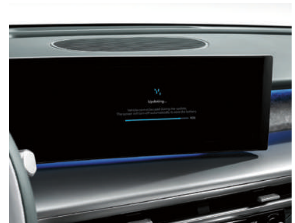
Bose® Premium Sound System (14 speakers) OTA Software Update (Over-the-Air Updates)