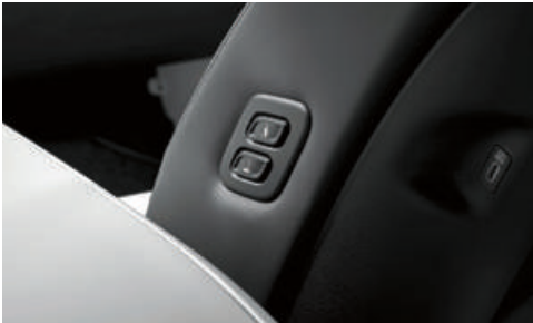
Walk-In Device (Passenger Seat)