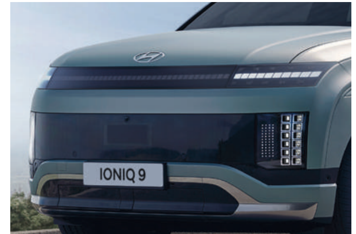
LED DRL & Positioning Lamps / Small Cube LED Projection Headlamps