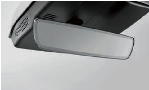
Electronic Chromic Mirror (ECM)