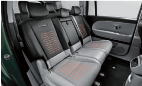
Heated Seats (2nd-row)