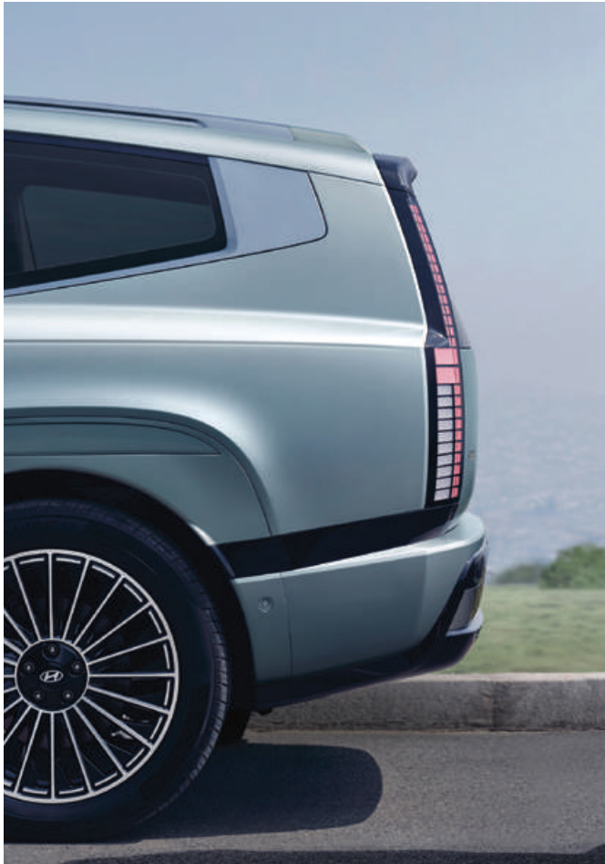
Bold Character Line