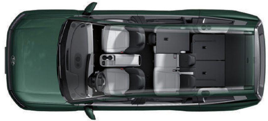
6:4 Split Folding (2nd-row)