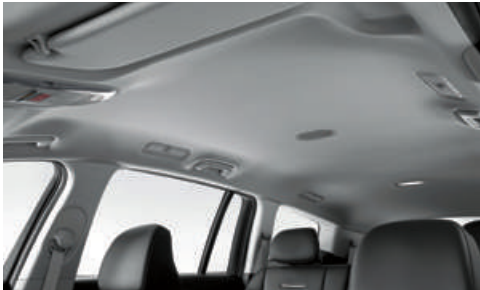
Bio-PET Fabric Headliner