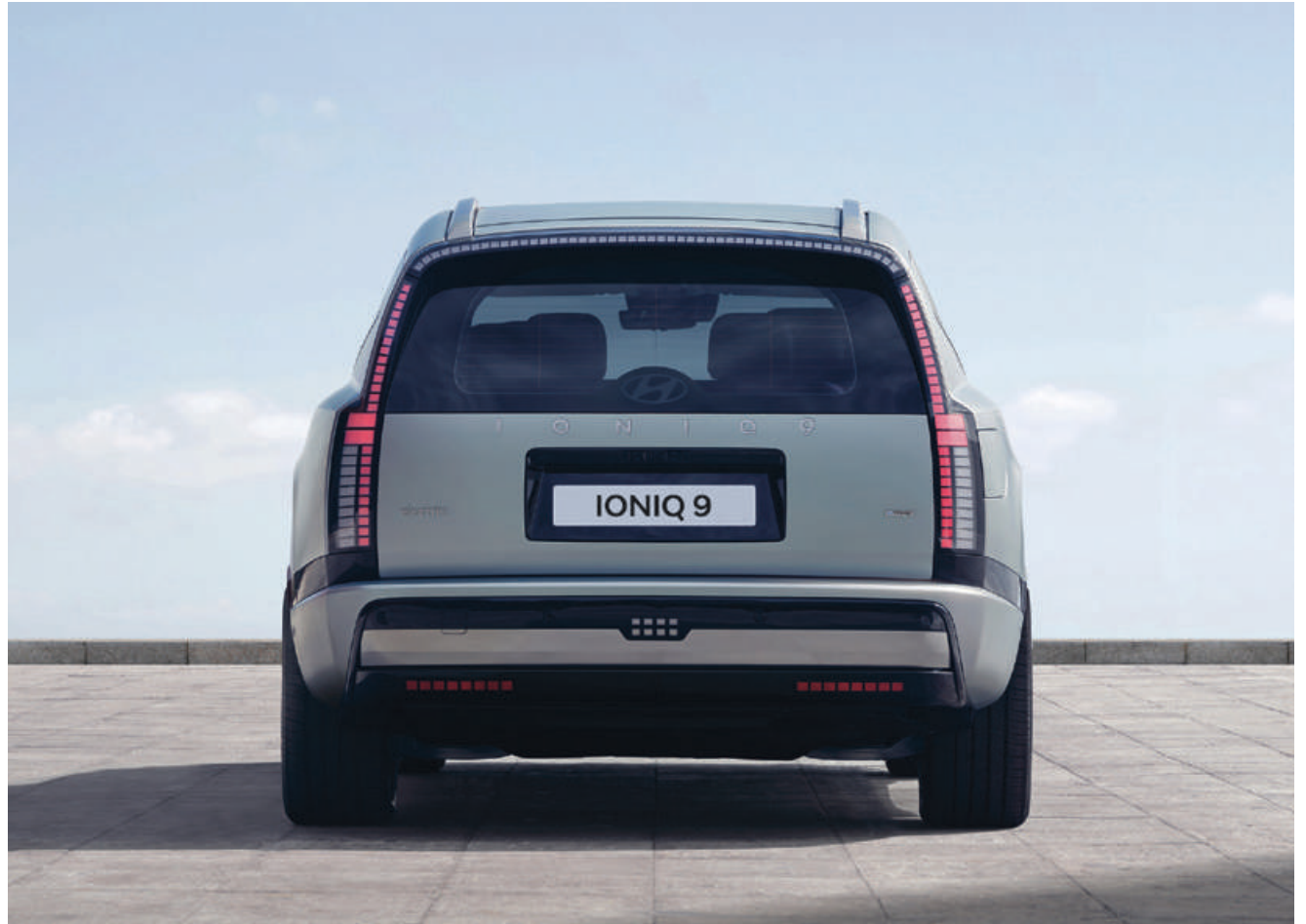
Boat-tail Inspired Design / Parametric Pixel Light Design