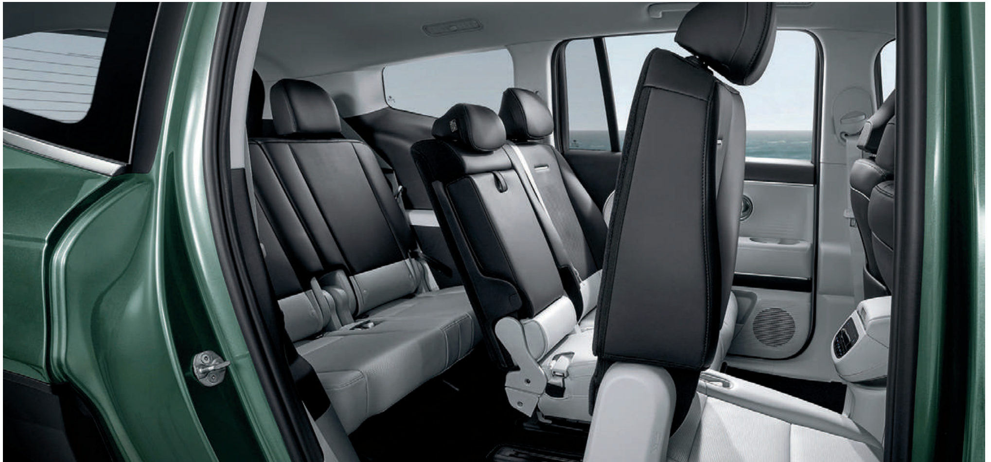
Tilting Walk-In Seat (7-Seater / 2nd-row)

Sit back and relax in lounge-like comfort in every seat inside IONIQ 9. Seamlessly blend privacy and togetherness through a variety of different seating options.